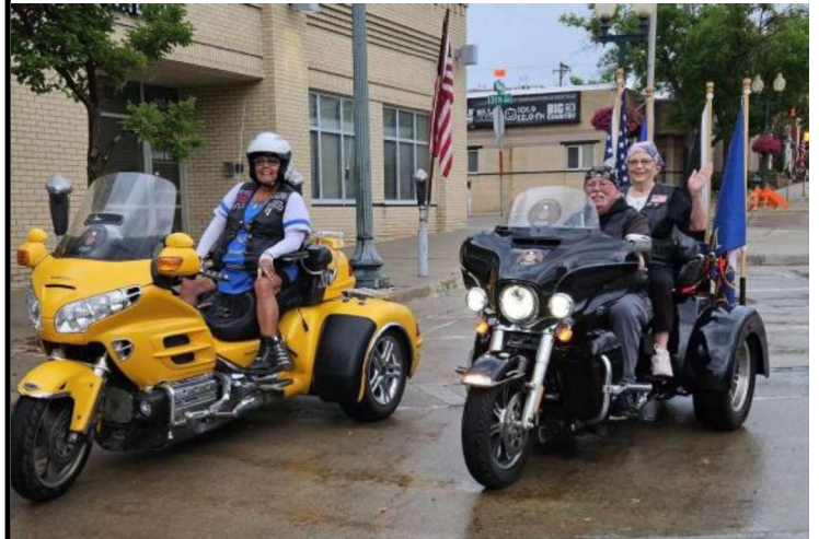
Independence Day Parade in Sioux Falls.

Anyone who rides a motorcycle and is a member of the Legion, Legion Auxiliary, or Sons of the Legion is invited to be a guest and join.