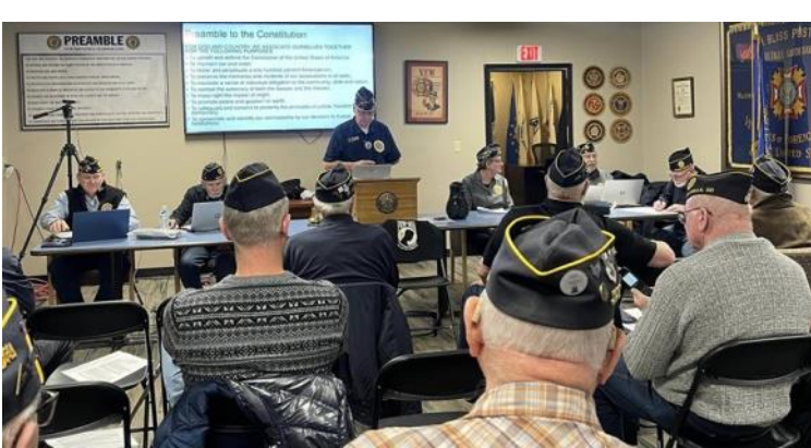
Post 15 monthly business meeting, February 6, 2024.