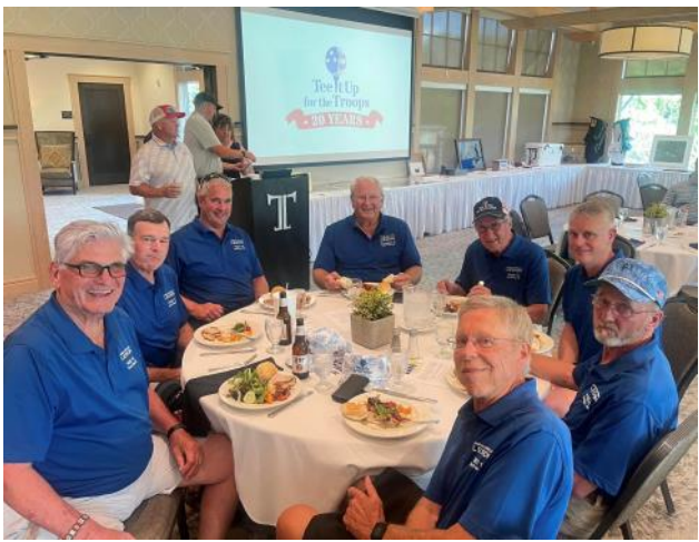
Two foursomes from Post 15 at Tee it Up For The Troops July 8, 2024 at Sioux Falls Country Club .