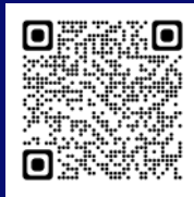
Post 15 website