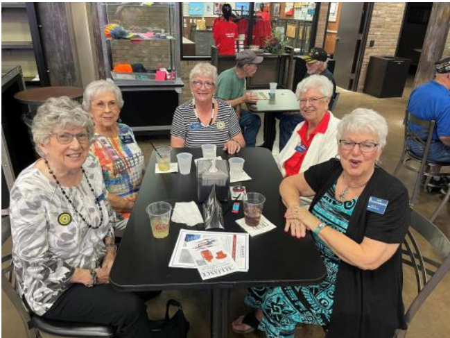
Unit 15 Auxiliary members. July 16, 2024.