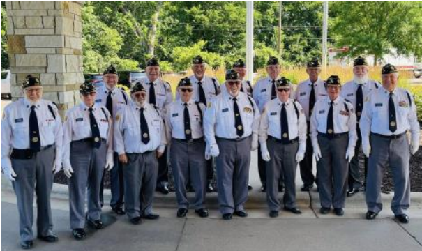
Post 15 Honor Guard at Tee it Up For The Troops July 8, 2024 at the Sioux Falls Country Club.