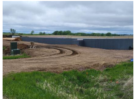
View of lower level poured walls and floor from the road at the southeast corner of the property

BB Gun shooters recently competed in the State tournament at Pierre. Many shot their personal best. They are now practicing and studying for the Nationals at Rodgers, Arkansas, June 29 to July 3. Sporter Air Rifle will have two shooters at Rodgers for a competition held at the same time. Precision Air Rifle (four shooters) is shooting at Anniston, Alabama, for USAS Nationals June 8-14. They are shooting both Air Rifle and .22 Small Bore at this competition. They are also sending six shooters to Port Clinton CMP Championship on July 7-14. Here are photos of the new building's progress.