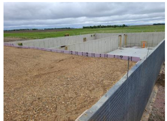
View from inside future second level southwest corner, viewing poured walls and floor. First level floor will be set on top of lower level walls and then main level walls will be set.