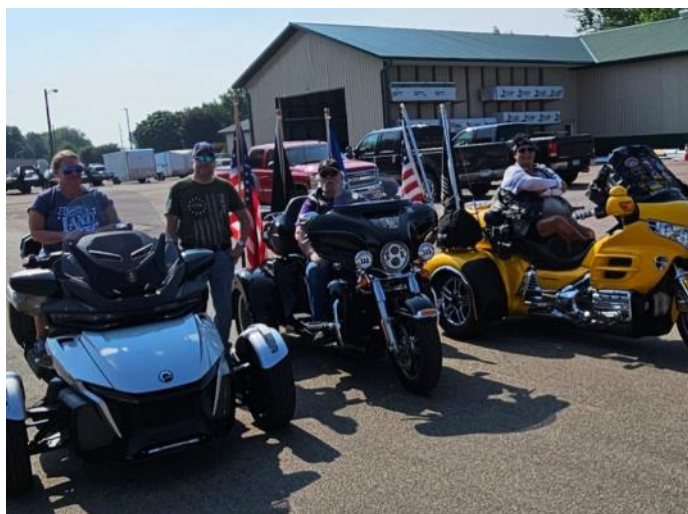
Buffalo Days Parade in Luverne

Quote of the Month: "True patriotism hates injustice in its own land more than anywhere else." – Clarence Darrow