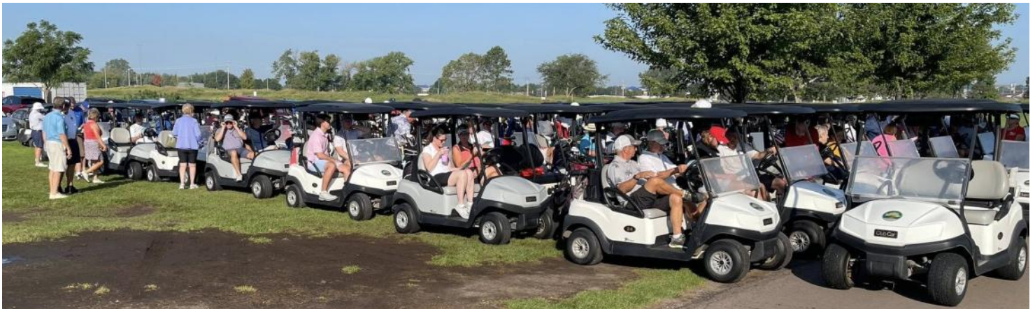
Full field of golfers at the "Chip in For Vets" golf tournament at Elmwood Golf Course. August 19, 2025.

BB Gun finished in second place nationally, but I heard nothing about scholarships awarded. Daisy is continuing the practice of awarding the top ten shooters that started last year. We had one top ten shooter who received a scholarship. All teams are taking a break and the first to begin practice will be the Precision team starting mid-September for a match at Anniston, Alabama, from Oct 9-12. Sporter Air Rifle will start early October and BB Gun in early January. The new building is water tight and FUND RAISING continues. They are running a CHASE THE ACE game with current pot of about $3,500 at the Humboldt Bar on Sunday afternoons from 4-5 p.m. We provide minimal support for these teams while they travel the country advertising for us. I am planning on attending some of these to maybe win and show my support. Can't win if you don't play, right?