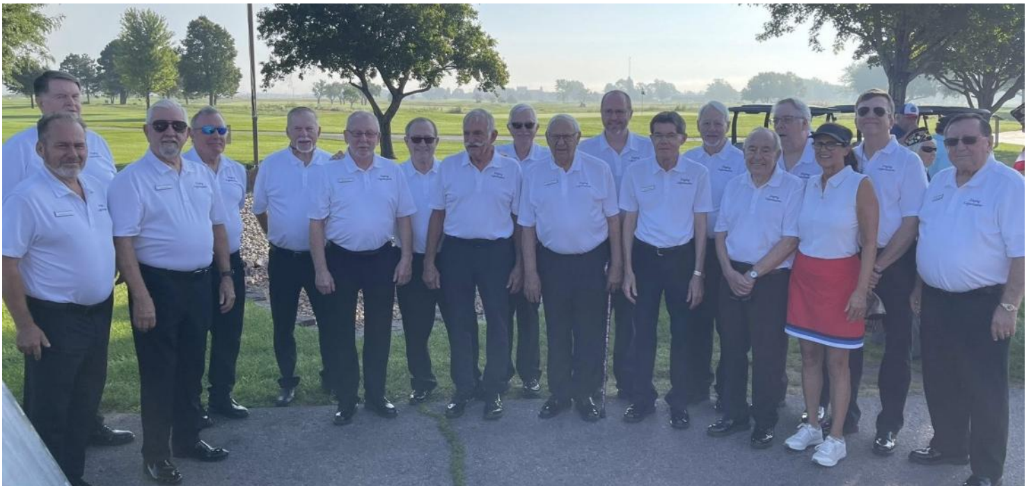
American Legion Singing Legionnaires opening the "Chip in For VETS " Golf Tournament on August 19, 2025, by singing the national anthem.

If you have ever considered joining the Honor Guard, now is a great time to step forward. There is very little cost involved, and your commitment makes a tremendous difference to the families we honor and to our Post.